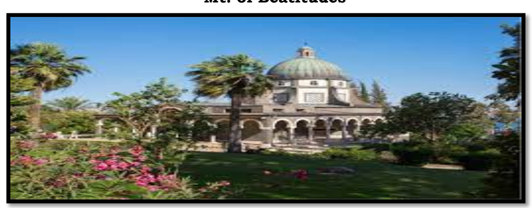
Mt. of Beatitudes

• Tabgha : Feeding the 5,000 people – " Creation Moments" with Dr. Buffet dinner at the hotel